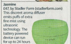
Jasmine £47, by Stadler Form (stadlerform.com) This discreet aroma diffuser emits puffs of extra fine mist using ultrasonic technology. The battery powered device can run for up to 24 hours