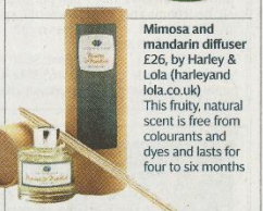
Mimosa and mandarin diffuser £26, by Harley & Lola (harleyandlola.co.uk) This fruity, natural scent is free from colourants and dyes and lasts for four to six months