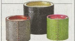
Leather collection From £145, by Rachel Vosper (rachelvosper.com) These come in several sizes and fragrances