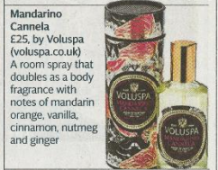
Mandarin Canela £25, by Voluspa (voluspa.co.uk) A room spray that doubles as a body fragrance with notes of mandarin orange, vanilla, cinnamon, nutmeg and ginger