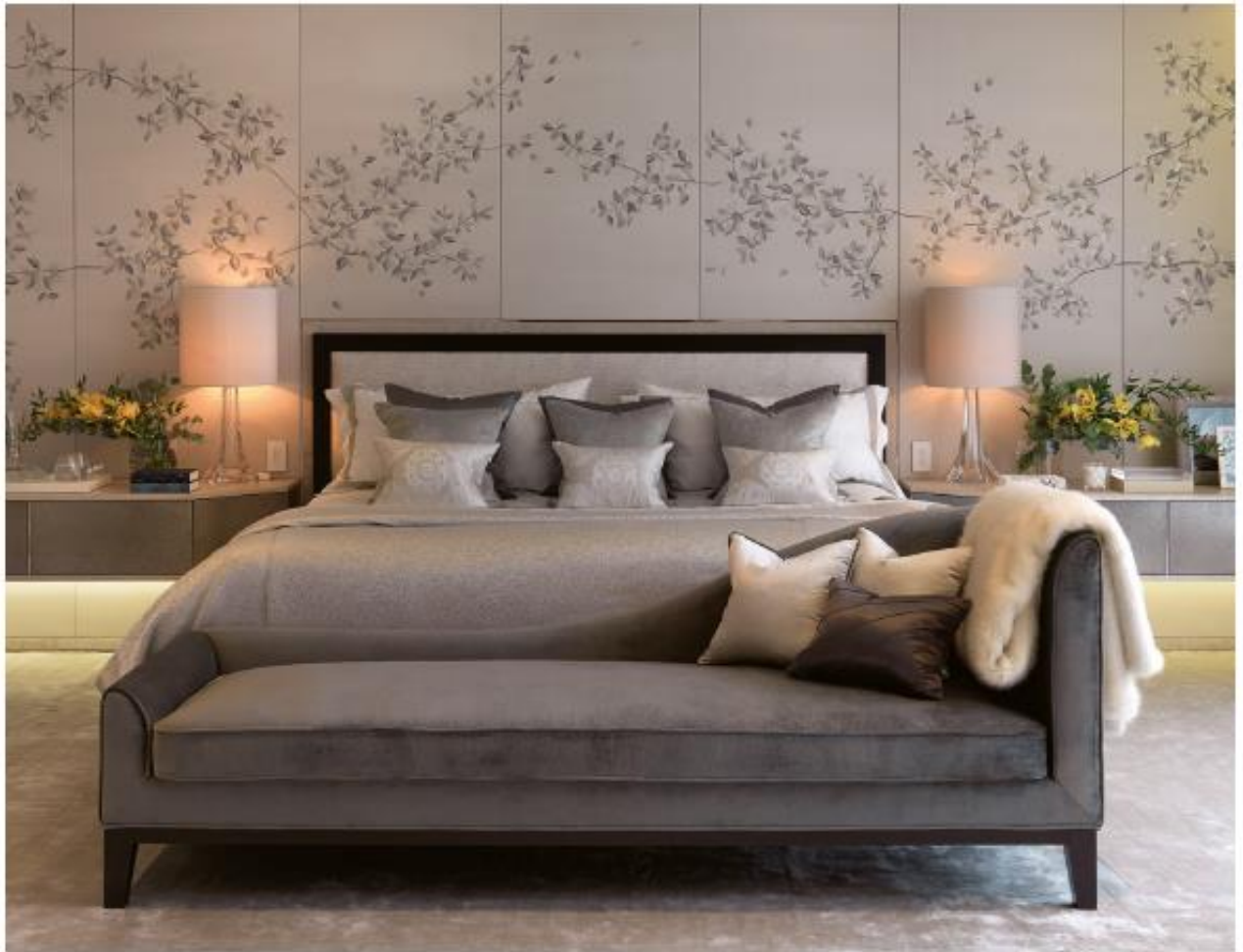
The rear of the property looks out on some wonderful foliage which inspired a custom-designed headboard wall in the master suite, hand-painted and embroidered with leaves and branches on a field of silk

Outside, the excavation of the site down to a depth of 10.5m also allowed Isaac and his team to produce a tiered garden on the lower ground floor level, in addition to the two terraces on the ground and first floors.